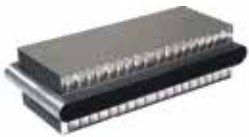
Single-Row Condenser tubes (SRC®)

The heat exchanger's finned tube, which is the core technology of the air cooled condenser, is the Single-Row Condenser (SRC®) tube. This is an elongated aluminium clad carbon steel flat tube with brazed aluminium fins.