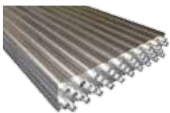
RAFT: Round aluminum finned tubes