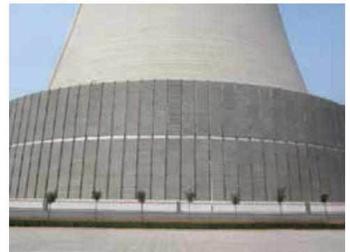
Cooling delta with louvers